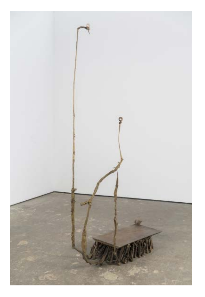
Transfer Station, 2017. Bronze and porcelain, 73 x 24 x 13 inches.