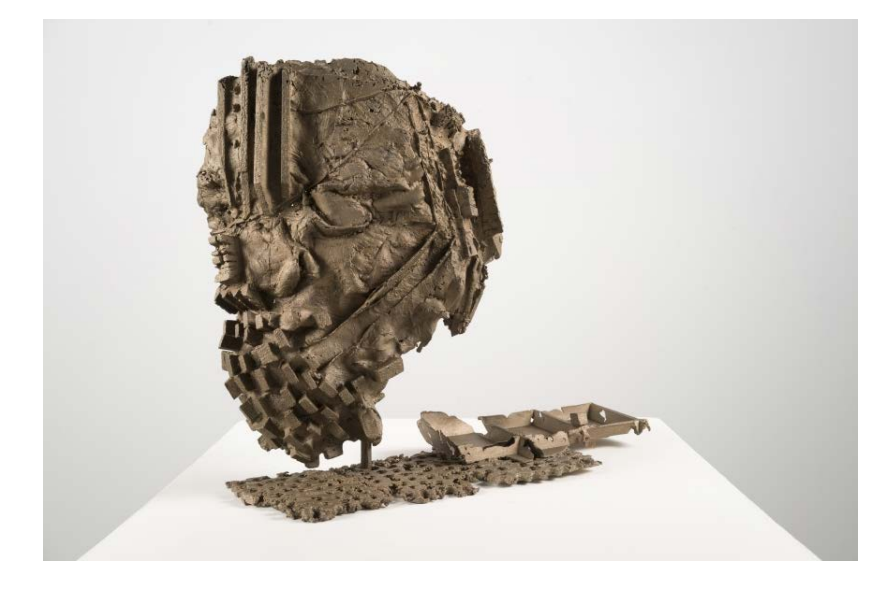
REFLECTION, 2017. Bronze, 18 x 12 x 7 1/2 inches. Courtesy of Anthony Meier Fine Arts.