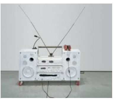
Tom Sachs: Boombox Retrospective 1999– SFAQ