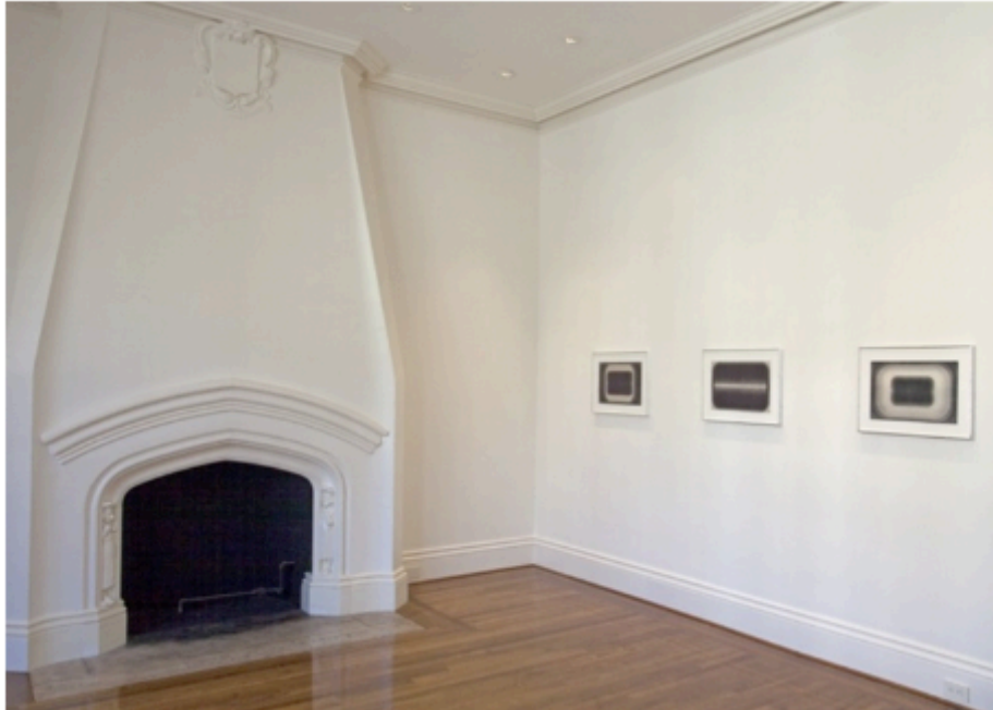
Marsha Cottrell, Installation View (2016).