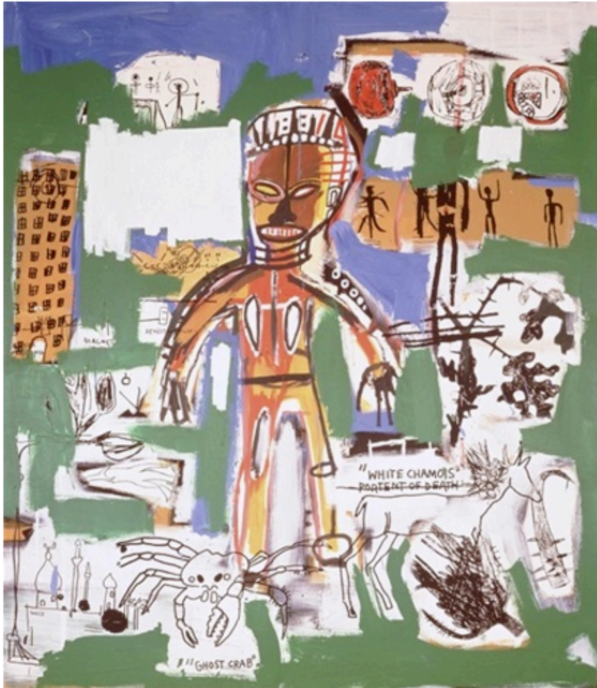
Jean-Michel Basquiat, Bushwick Avenue (1984).

Exhibition: "20th Anniversary Exhibition"