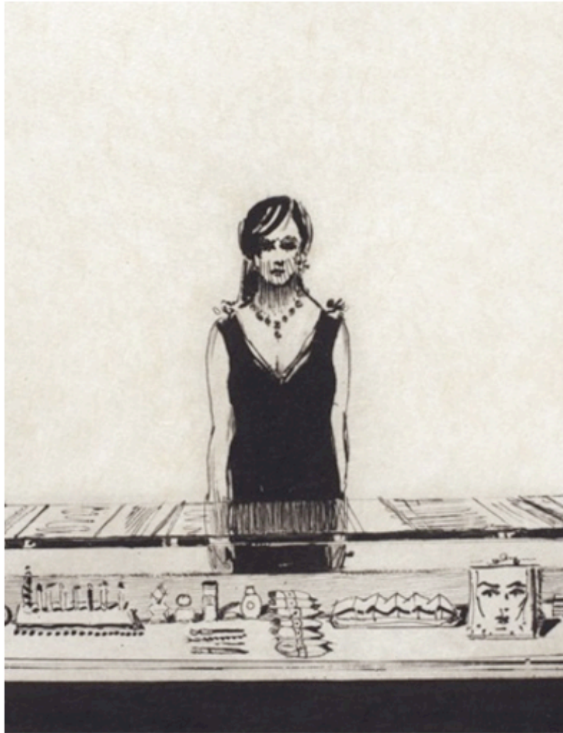
Wayne Thiebaud, Counter Woman (2015). Courtesy of Crown Point Press.

Exhibition: " Wayne Thiebaud: New Etchings "