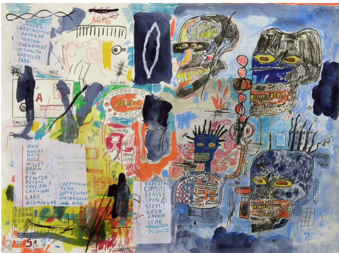
Jean-Michel Basquiat, Untitled (1984).