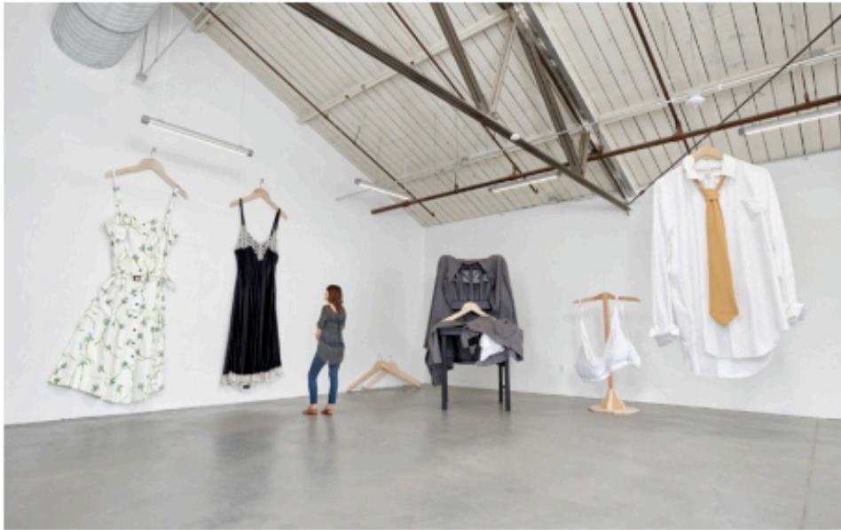
Sidney Russell, Installation View (2016).